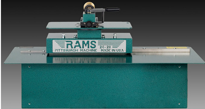
Shown with Optional Power Flanger

Dealer: Address: City: State/Zip: Phone: